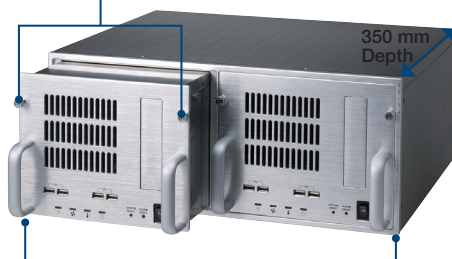
Dual Nodes Design

Thumb Screws to Fix The Sub-System in the Cage